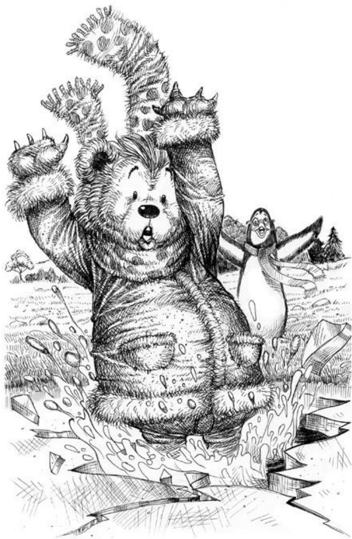
Greedy plunged into the pond of icy water